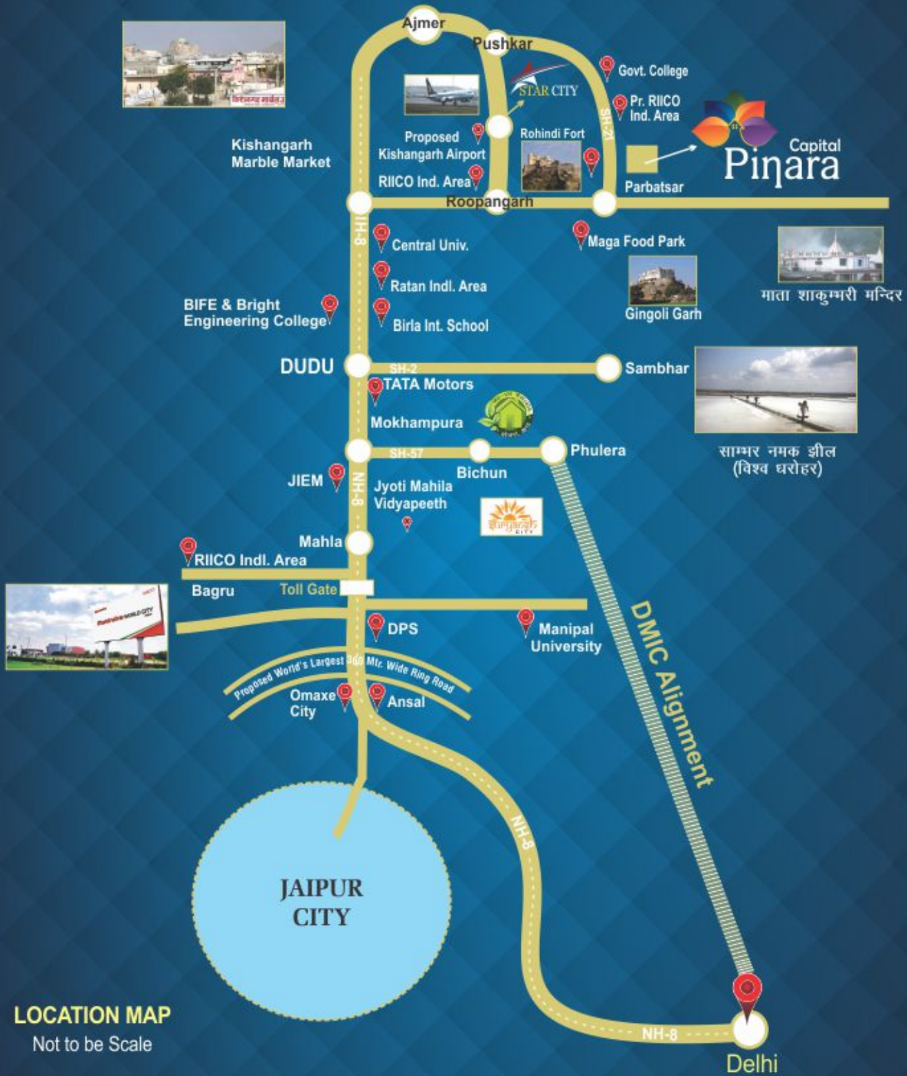
LOCATION MAP Not to be Scale